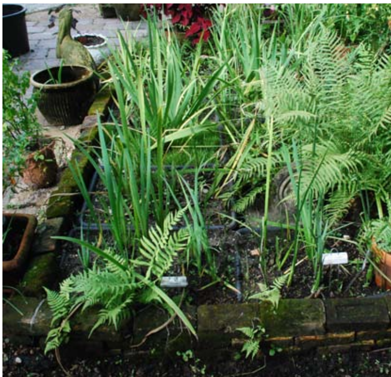
A section of the garden with irises in mixing tubs placed so that the rims overlap. These are awaiting mulch.

my iris beds with these mixing tubs set one next to the other on the soil surface, or on landscape fabric in a few areas. The rims of the tubs can be overlapped to