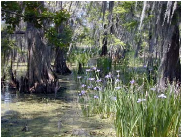
Iris giganticaerulea growing in a swamp in Jean Lafitte. In the wild, this species is always found growing in water, either in swamps or open fresh water marshes.

On the one hand, it has been important to convince people that these "swamp plants" do not have to grow in standing water. Gardeners can succeed quite well with them in a bed alongside annuals and perennials of many kinds. On the other, optimal performance may not be attained if their Louisiana irises get only the amount of water that the "average" plant needs.