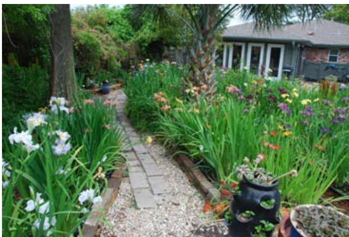
The tubs are placed throughout the garden and have replaced conventional beds.

I have no idea what happens with the chemistry of those tubs. I have used mainly time release fertilizers applied as if the tubs were containers with drain holes. It has seemed to work, but I am sure there is a much more refined and informed approach that would be preferable. I suppose an ideal container system would be one that more closely emulated a real bog in which there is some natural, albeit very slow, movement of water.