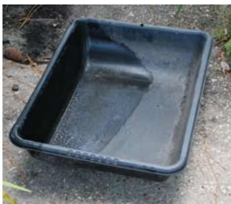
A mortar mixing tub from Home Depot, six inches deep with no drain holes.

These mixing tubs are sold in two sizes, one about six inches deep that measures 18 by 24 inches and the other two inches deeper and slightly longer and wider. There are no drain holes. The smaller size sells for between six and seven dollars and the larger between twelve and thirteen dollars. They are black and made of some sort of thick plastic material. They will crack if hit hard, stepped on, or lifted while full of soil, but they otherwise seem sturdy and probably are reasonably long lasting. These trays can be sunk into the ground or placed on the surface.