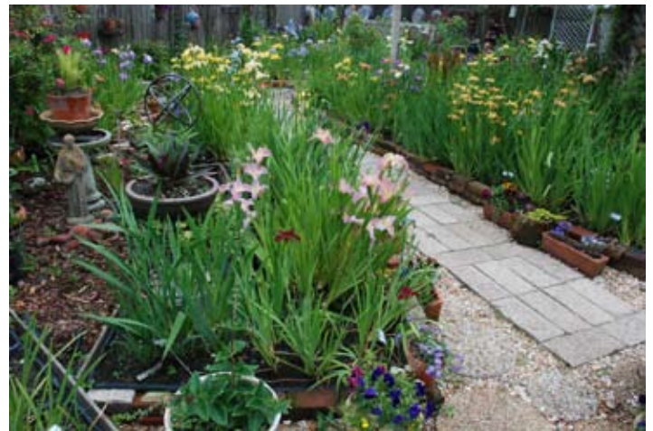
Bloom season 2015 with the irises growing in the mixing tubs.

A bog replacement for normal beds does not require a landscape of uninterrupted Louisiana irises. There are many interesting plants not often found in the garden that can be grown in the tubs with the irises. Marsh Fern ( Thelypteris palustris ) and various forms of papyrus thrive under these conditions. I devote one entire tub to a Royal Fern ( Osmunda regalis ), which provides great texture that contrasts nicely with iris foliage. Pickerel Weed ( Pontederia cordata ) has beautiful blue-purple flowers and also a nice contrast of foliage texture. The deep red foliage of the hybrid Crinum 'Menehune', Red Bog Lily, is a wonderful ac-