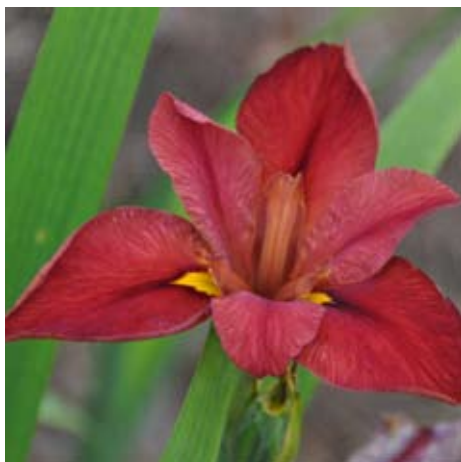
Who's Ya Mama