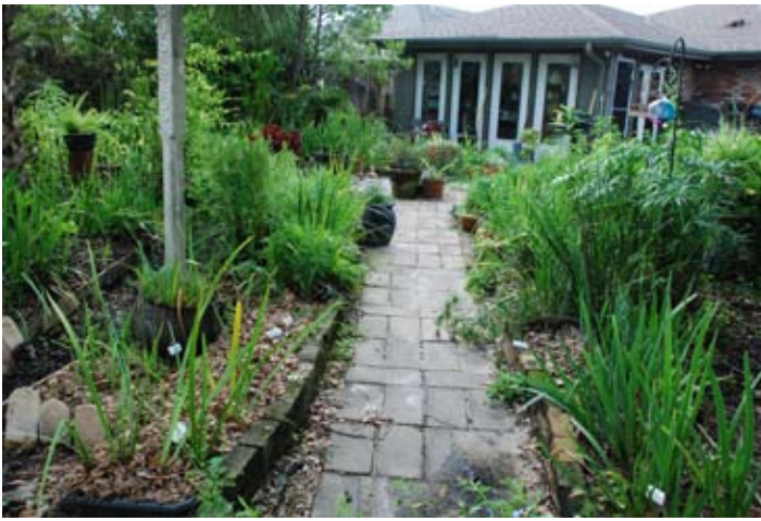
A garden walkway lined with bricks to hide the sides of the mixing tubs and mulched with Live Oak leaves.

two or three high. When mulch is added and the irises are growing well, the tubs are essentially hidden, and the look, to me, appears natural.